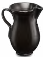
REF. 96021 Jug Classic | Jarra Classic Pichet Classic