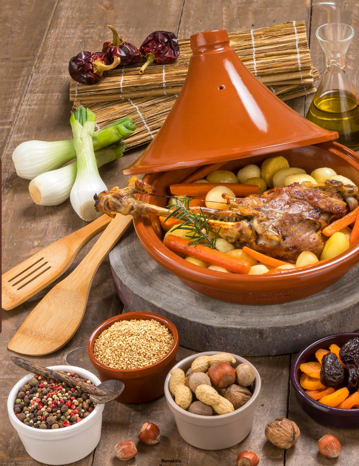
Ramekins Ramequins Ramequins — P. 67