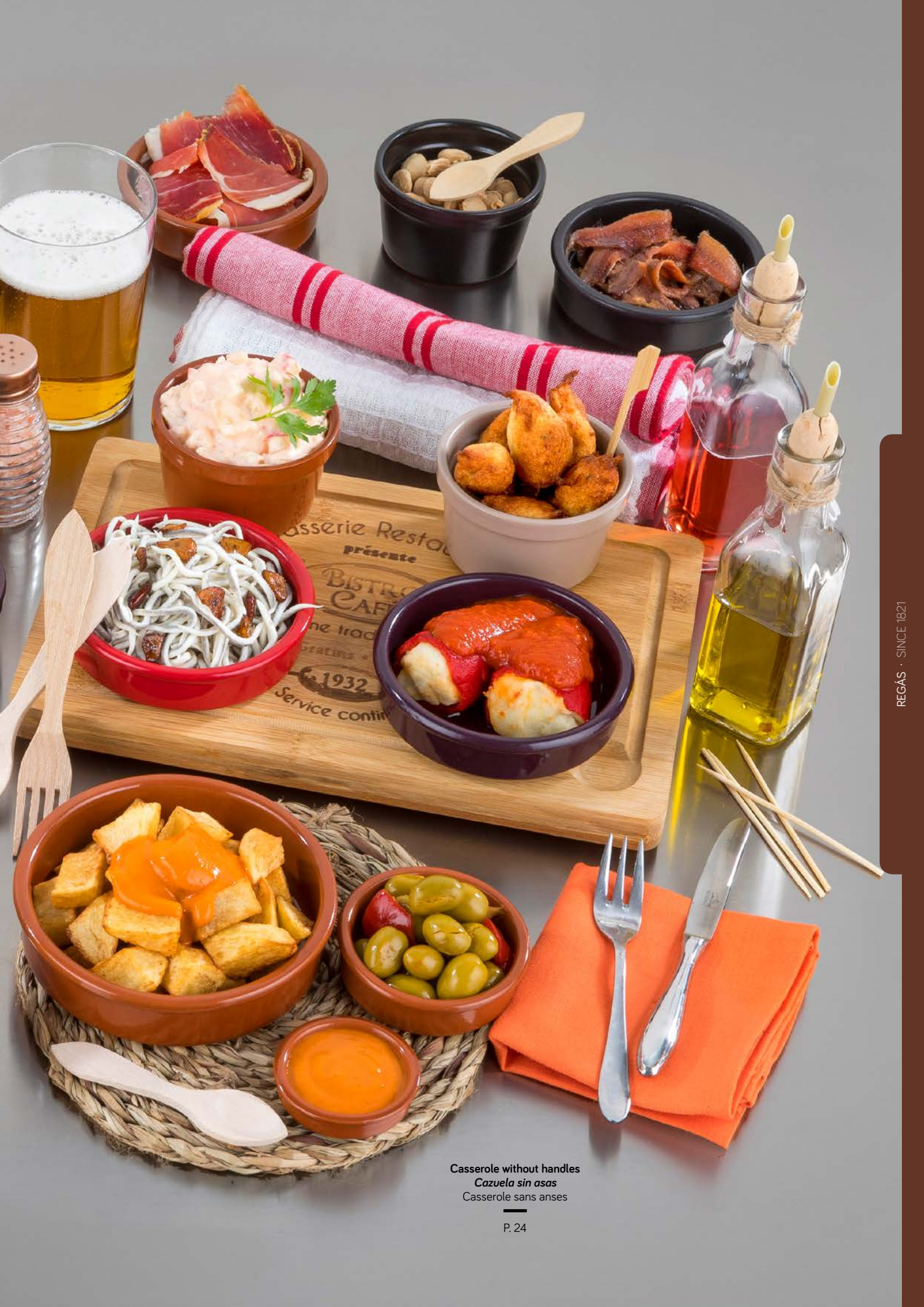
Casserole without handles Cazuela sin asas Casserole sans anses