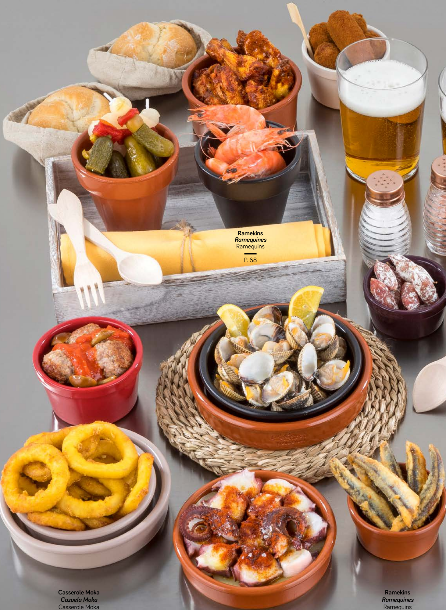
Ramekins Ramequines Ramequins P. 68